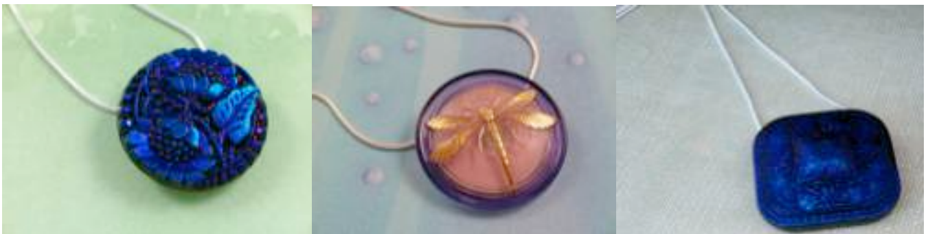
Czech Glass Square Item# CZ-5