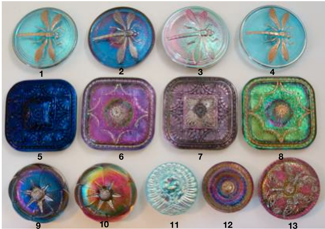
Czech Glass Square Item# CZ-15